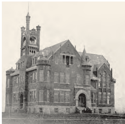
Administration Building, 1897